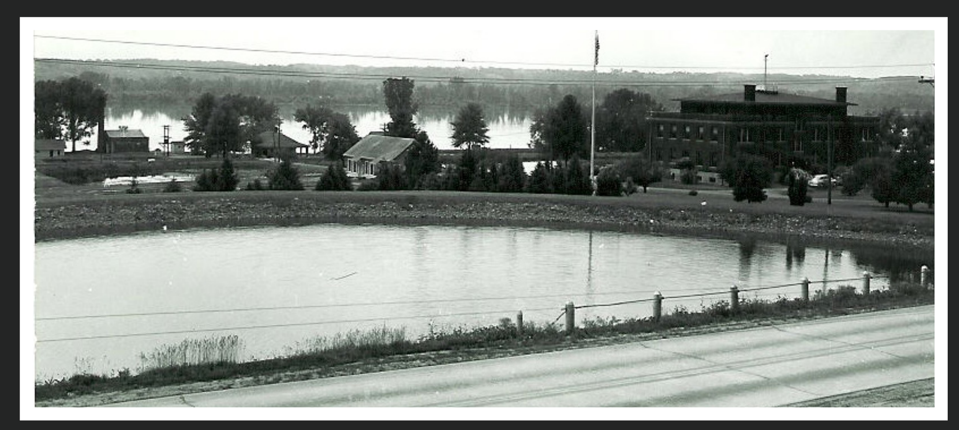
Overview of Reservoir and Main Laboratory in 1920, facing southwest.