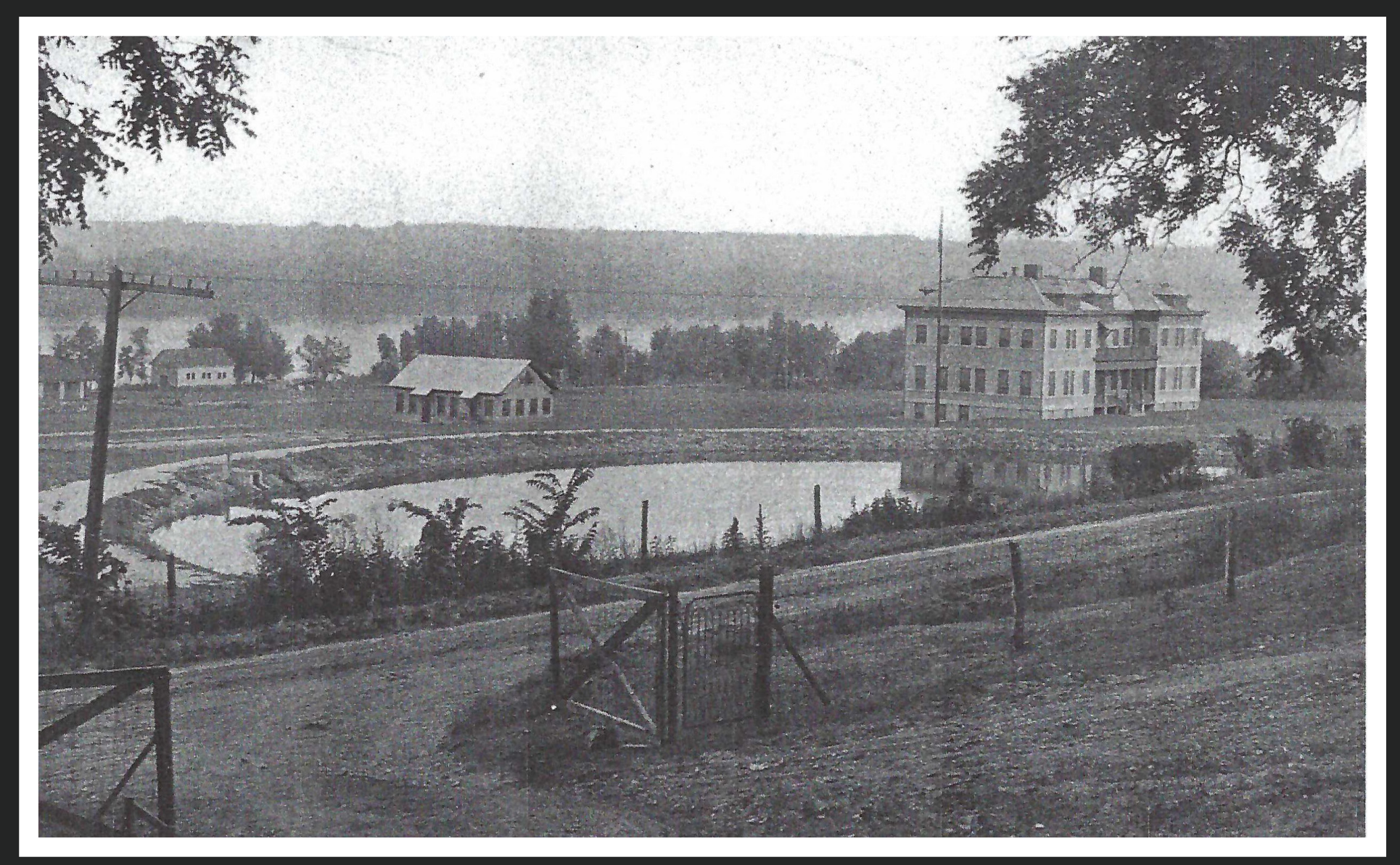
Overview of Fairport Biological Station ca. 1914, facing southwest.